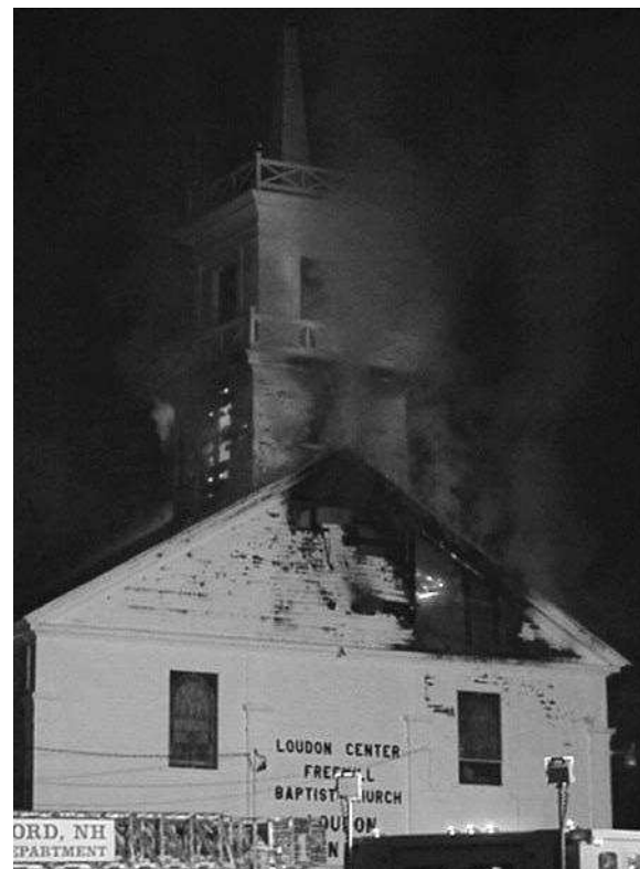
This was the scene Sunday evening, June 12, 2005 as a fire started by a lightning strike burns in the Loudon Town Hall/Loudon Center Freewill Baptist Church.